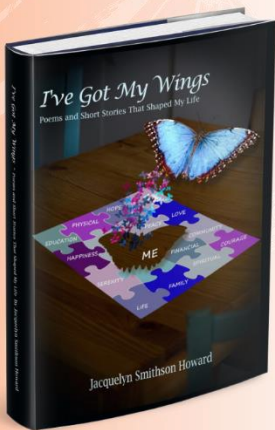
I've Got My Wings Book